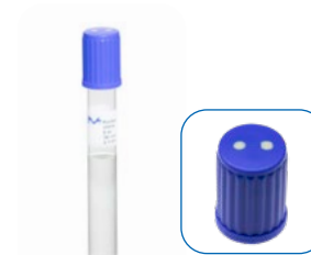
Tube with screw cap with 2 septa.