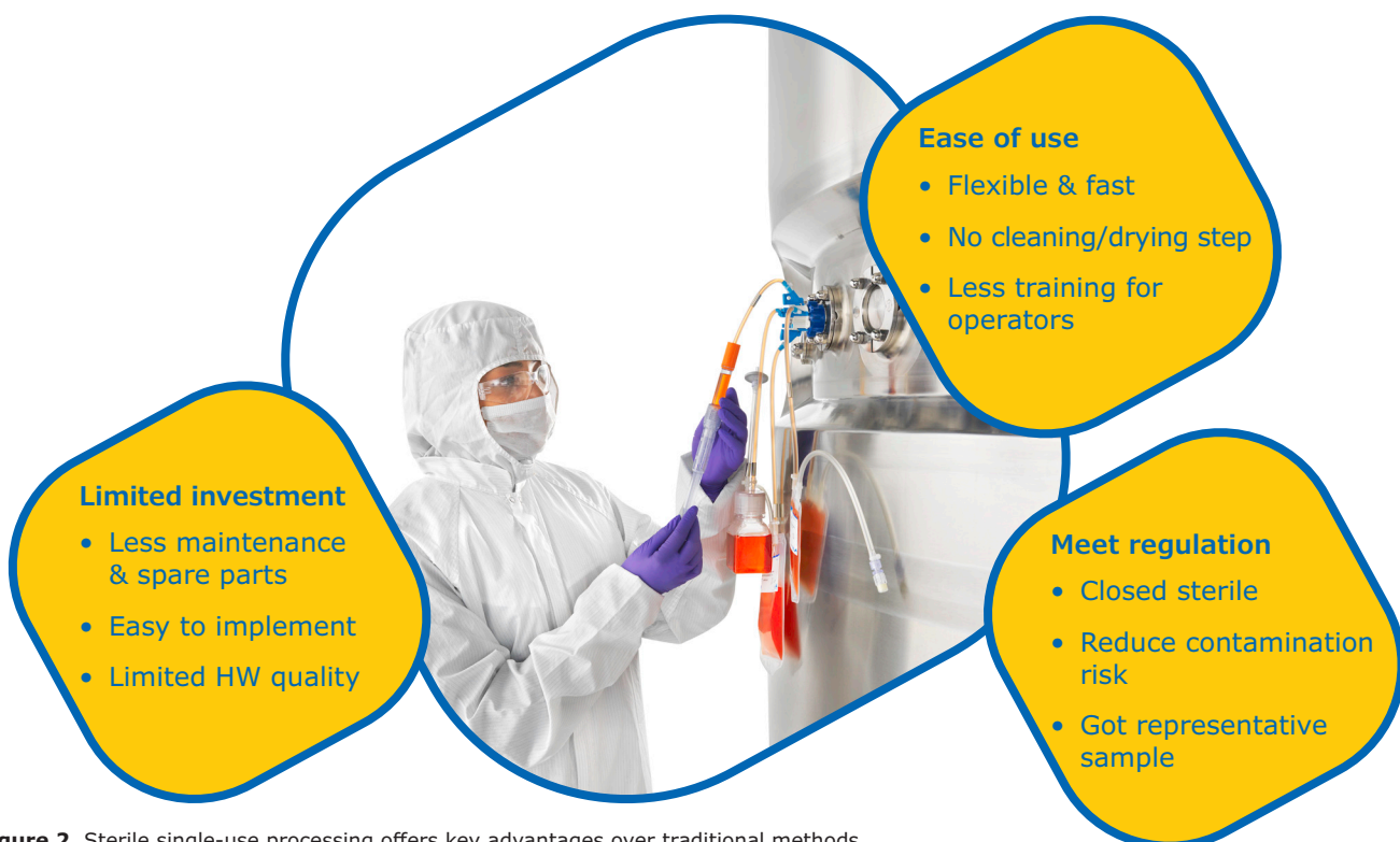
Figure 2. Sterile single-use processing offers key advantages over traditional methods.

As shown in Figure 2, closed, aseptic process sampling offers several advantages when compared to traditional methods, including ease of use, better alignment with regulatory requirements and a limited investment. The specific ways in which closed sampling meets regulatory recommendations are summarized in Table 3 and include contamination control, elimination of operator bias, the ability to collect representative samples and improved health and safety.