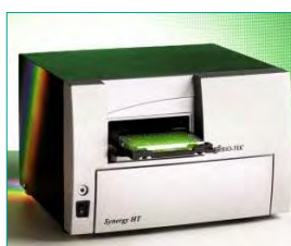
8. Signal read out (Colour reaction and signal read out, 15 min)