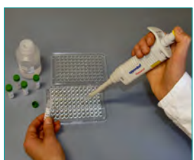
4. HybriScan® test solution (Forming of "sandwich complexes" between specific probes an the sample , 10 min)