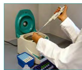
3. Cell lysis (2 ml sample, 13.000 rpm; 37°C, 45-60 min)