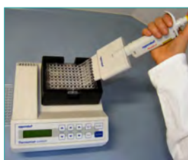
5. Immobilisation (Binding of the "sandwiches" to the binding plate, 10 min)