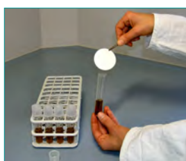
2. Enrichment culture, optional (MRS-Broth, 24h)