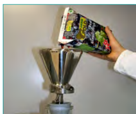
1. Sample filtration (100 – 1000 ml, 15 min)