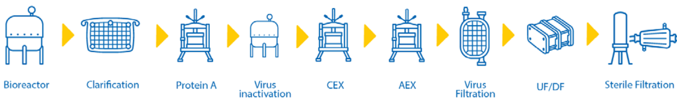
Figure 1. Typical mAb process train. Sterilizing-grade membrane filters may be placed immediately upstream of multiple chromatographic or UF/DF purification steps.

This report summarizes relative throughput capacity performance of these filters at different processing steps with mAb fluid streams. The information provided may guide product selection however it is always recommended to run process development screening studies before selecting a filtration product. Please contact our technical support representatives for additional information.