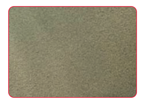
Figure 1. Monodisperse microspheres