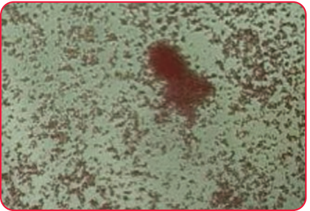
Figures 2 and 3. Aggregated microspheres