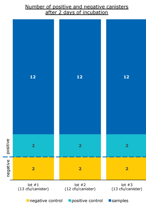
Figure 3: Number of positive (visible growth) and negative (no visible growth) canisters after 2 days

All 12 inoculated sample canisters showed bacterial growth for each of the three lots tested. As expected, all positive controls (bacteria but no antibiotic) were also found to be positive, whereas all negative controls (antibiotic but no bacteria) remained perfectly clear.