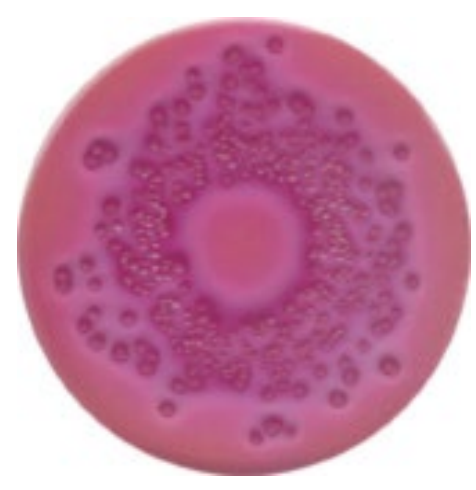
Escherichia coli ATCC® 8739