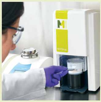
Put the unit into the MilliSnap™ system and close the safety glass