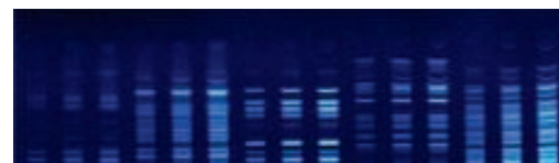
Separation of tryptic digest of proteins on ProteoChrom® plates