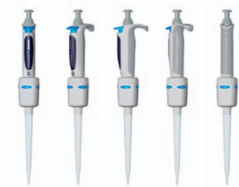
Transferpette® S 10 ml