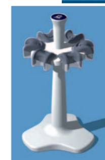
Freely rotatable stand for handy storage of Transferpette® S and Transferpette® S -8/-12 pipettes