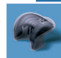
Shelf-rack mount for a single Transferpette® S pipette