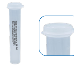
Type 5: Plastic vial with a plastic flip cap. Picture depicts 12 mL vial with filling volume of 9 mL.