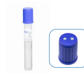
Tube with screw cap with 2 septa.