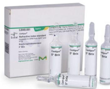
Table 18. Refractive Index Standards