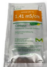
Table 7. Conductivity Standards

These conductivity sachets are designed for direct application into the field sample during environmental analysis (at the river or similar places). They are ideal for mobile analysis. In principle, you do not even need a beaker. To measure, the electrode can simply be inserted into the sachet.