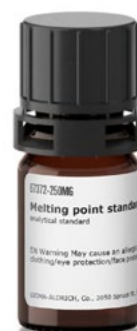
Table 10. Melting Point Standards

Learn about the two popular modes of melting point evaluation, along with the European Pharmacopoeia's approved method from this extensive technical flyer: The Melting Point Standards Technical Flyer