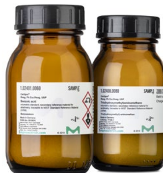
Table 2. Volumetric Standards