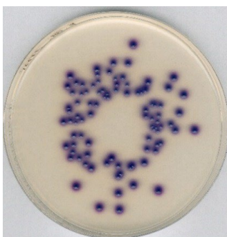
E. coli ATCC 11775

A recovery rate of 70 % is equivalent to a productivity value of 0.7.