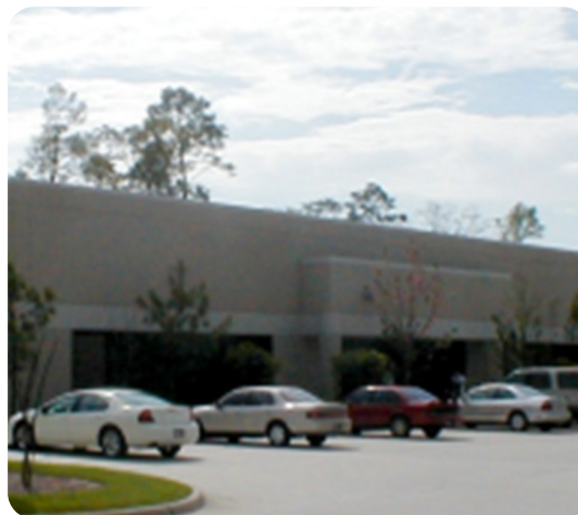
The Woodlands, Texas, USA. IVD Oligo Centre of Excellence