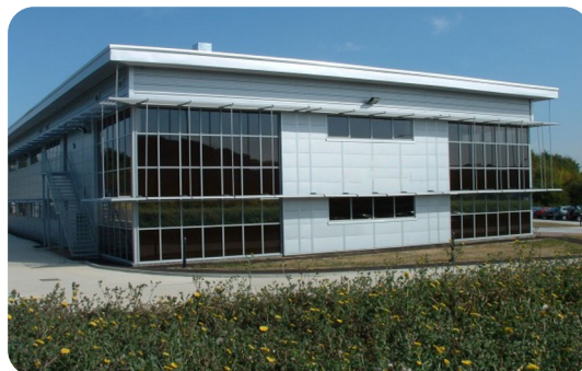
Haverhill, UK IVD Oligo Centre of Excellence